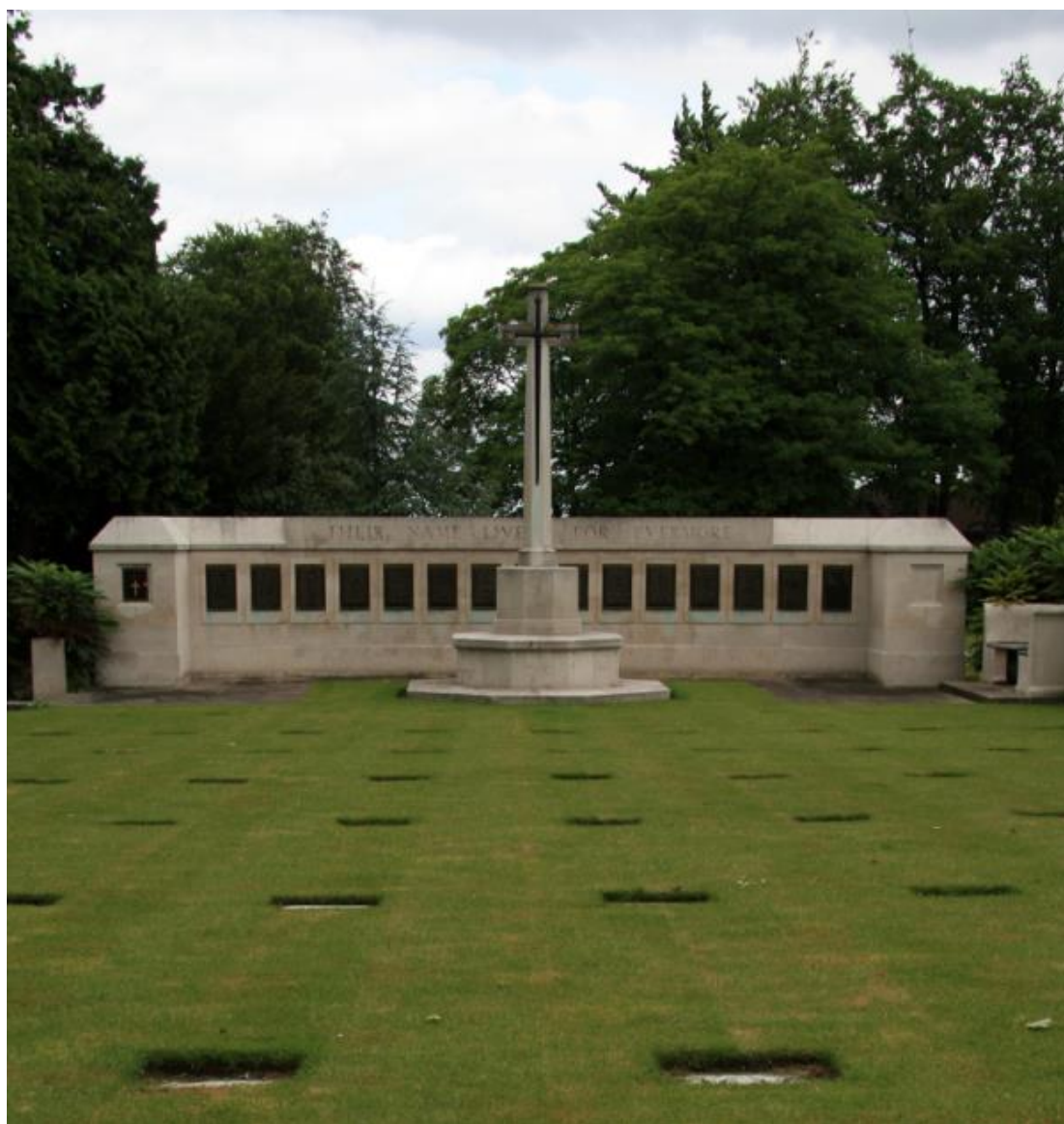
Screen Wall with named bronze panels within Plot K of Epsom Cemetery, Surrey

There are six soldiers buried in Epsom Cemetery, Surrey who served with the Australian Imperial Force in World War 1. These six soldiers are named on bronze panels on the Screen Wall, within Plot K of the Cemetery. The bronze panels on the Screen Wall have the name, service number, rank, date of death, age & plot number. The plot numbers on the bronze plaques correspond to plaques located in the lawn immediately in front of the Screen Wall. There are 110 plaques on the lawn which do not have individual headstones, unlike most other Commonwealth War Graves Cemeteries.