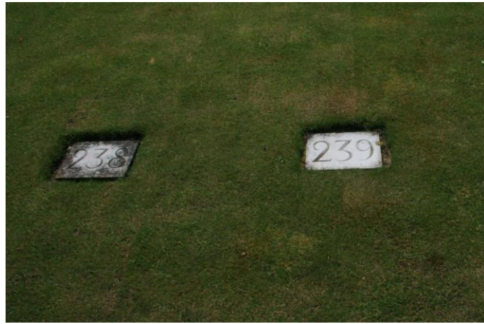
Example showing Pte Cummings in Plot 239 & the Numbered Lawn Plaques in front of Screen Wall

Arrow showing Pte Thomas Harrison's Plot number 82 (Note there are 3 plots numbered 82)