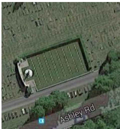
Aerial view of the Screen Wall burials