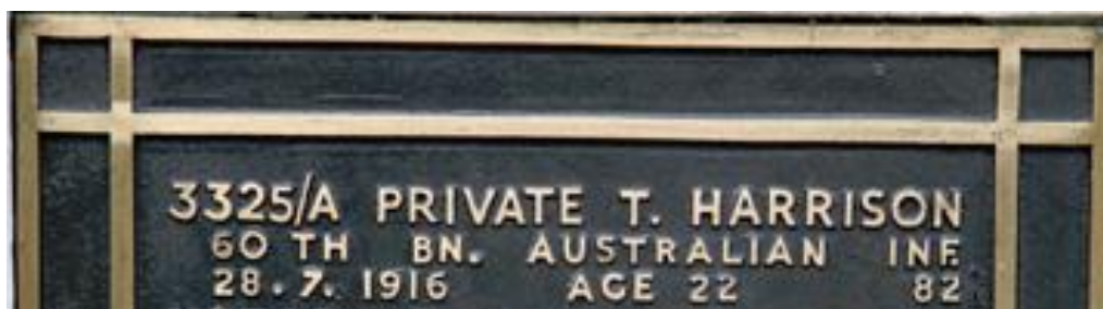
Photo of Pte T. Harrison's name on the bronze panels on the Screen Wall in Epsom Cemetery, Surrey, England.